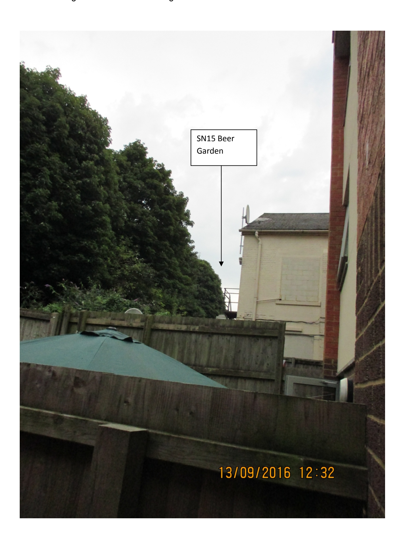
Flat 13 looking back towards the beer garden